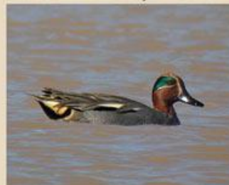
Figure 2: Adult male Common Teal, Gilbert Water Ranch Riparian Preserve in Gilbert, Maricopa Co., Arizona, 2 March 2008. This picture shows the coarser vermiculations on the sides.

The taxonomy of birds in the Anas crecca/carolinensis complex is unsettled (Livezey 1991). Behavioral, morphological, and molecular genetic