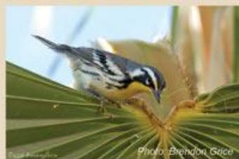
Yellow-throated Warbler ( Dendroica dominica ), Arizona City Lake, Pinal County.