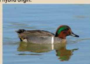
Figure 3: Adult male Green-winged Teal, Gilbert Water Ranch Riparian Preserve in Gilbert, Maricopa Co., Arizona, 10 February 2008. In contrast to the male depicted in Figure 2, this duck shows a conspicuous vertical breast band but no horizontal scapular stripe, and the white face pattern is subdued.