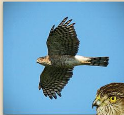
Below : Immature Sharp-shinned Hawk, female

Breast Pattern --Adult accipiters' breast are horizontally barred with warm buff to bright rufous, juveniles' vertically streaked with brown or rufous. However, though none of the field guides discuss it, immature