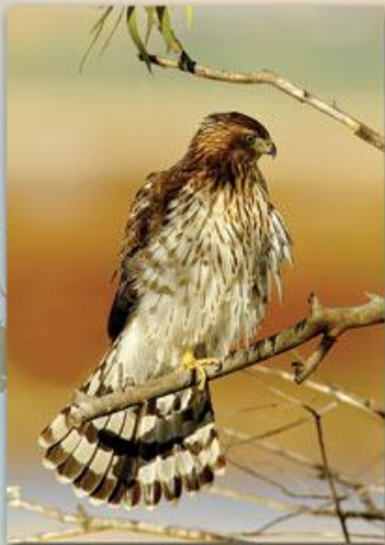
Above : Immature Coopers Hawk

Having a little trouble separating look alike accipiters, Cooper's Hawk and Sharp-shinned Hawk, from one another? Aren't we all, and this is the season here in the Valley when we are most likely to see these "bird specialists" as they hang around feeding stations waiting for an easy meal. This fall I spent a few days at Hawk Ridge in Duluth, Minnesota during peak accipiter migration. I'd like to summarize for you what I think I learned, but first let me draw an analogy.