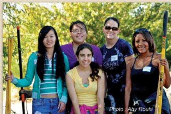
Students from Gilbert-Chandler Community College at the Gilbert Riparian Preserve during the DRAS work day.